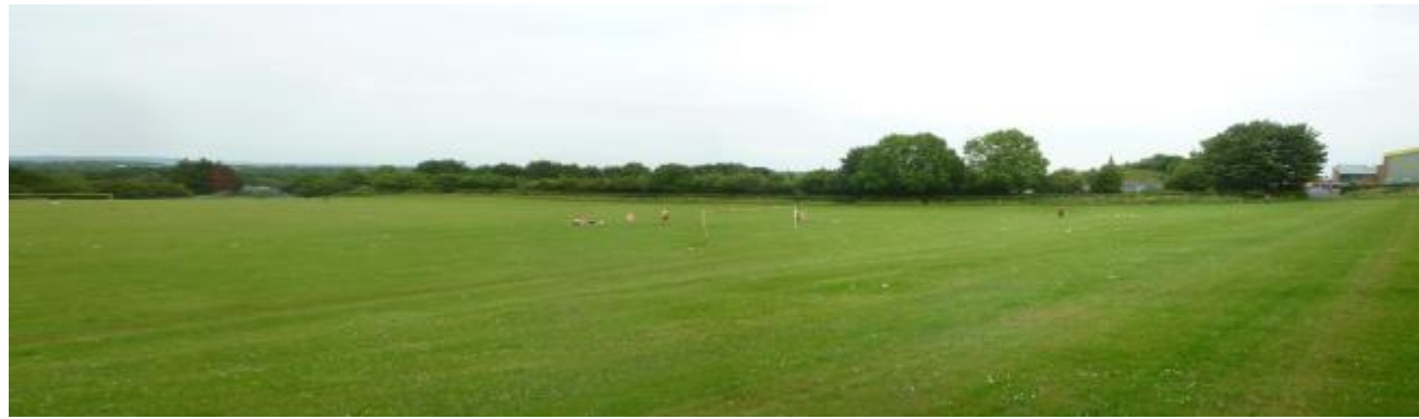
01 View to south across school public playing field towards northern boundary of site