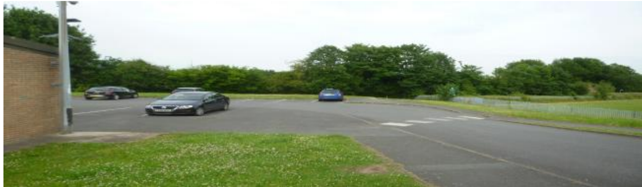
03 View to east into leisure centre car park, western boundary of site secured by raised bank and heavy planting