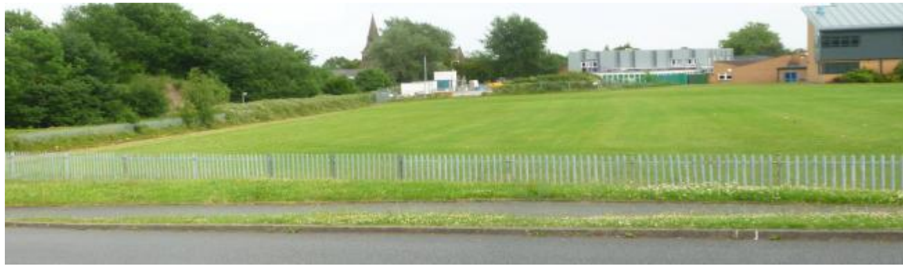
02 View to south east across school playing field. Public footpath runs along western boundary of site