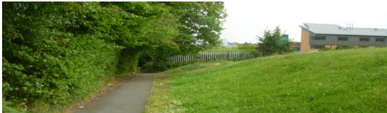
04 View to south along public footpath, western site boundary runs along left of path, screened by shrubs and trees