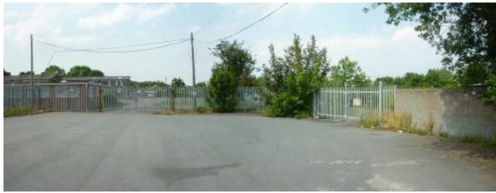
01 View of main entrance gate into site