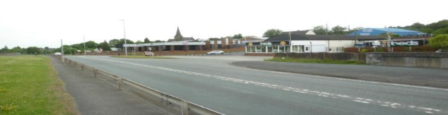
04 View to south of mould road junction