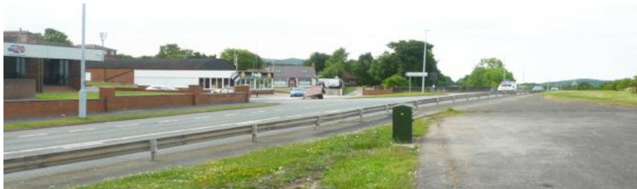
06 View to north of mould road junction, across carriageway