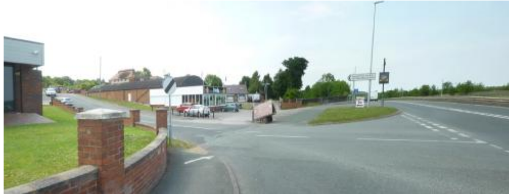
03 View to north of mould road junction