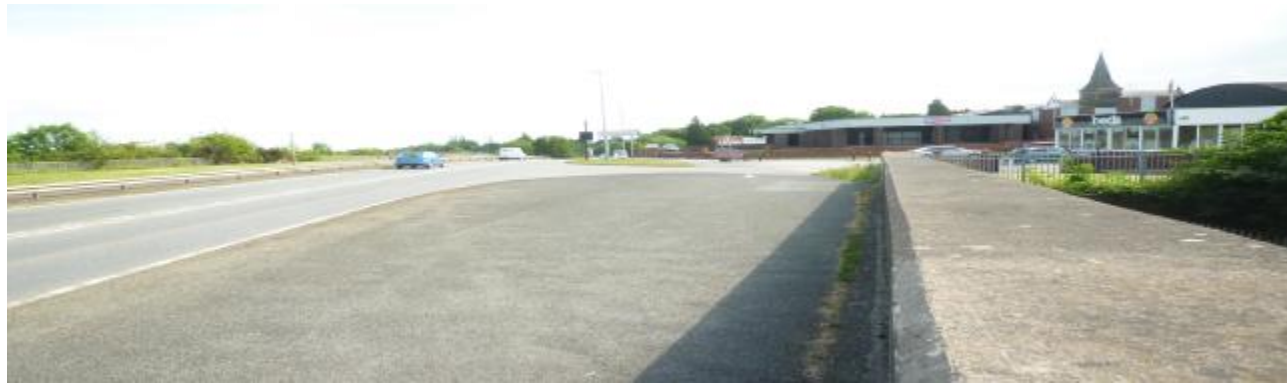
05 View to south, from railway bridge, or mould road junction