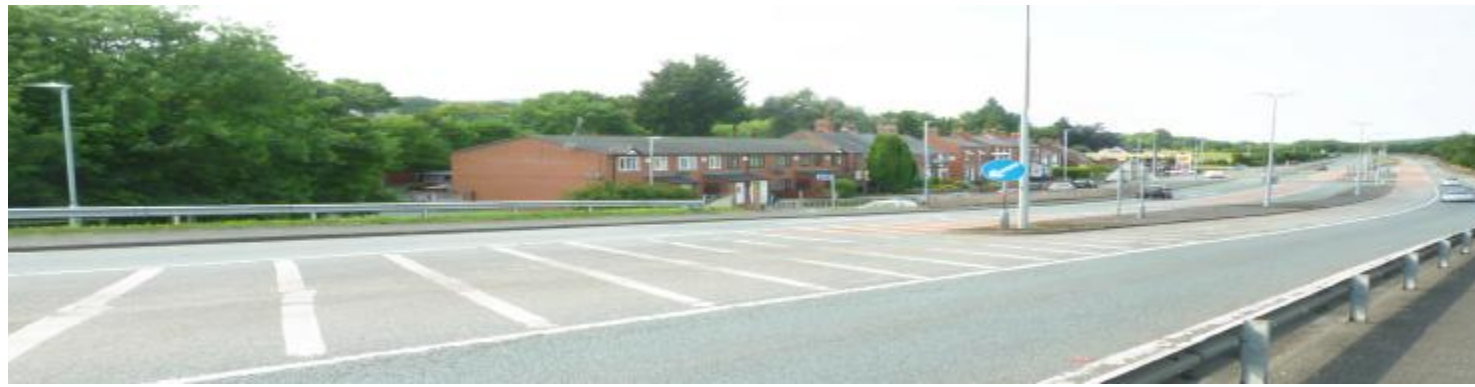
02 View to north along mold road